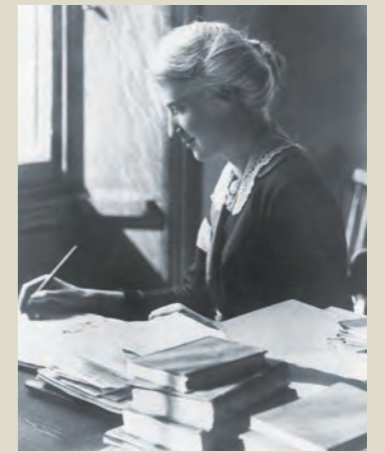
Eglantyne Jebb, founder of Save the Children

Save the Children is an international NGO that works to make children's rights to survival, development, protection and participation a reality worldwide. It was established in the UK in 1919 and is currently at work in approximately 120 countries. The UN and the governments of many countries have a high regard for Save the Children as a pioneer of children's rights, and we have achieved breakthroughs in the way the world treats children. Save the Children Japan was established in 1986. We are active in international programs in fields such as health and nutrition and education. When conflicts or natural disasters occur, we provide emergency and humanitarian responses. In Japan, we have actively addressed issues of child poverty and child abuse and have also conducted various programs in response to large-scale disasters, through these programs, we work to make children's rights a reality.