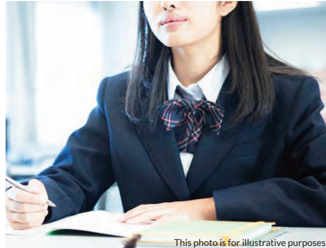
This photo is for illustrative purposes

Today, one in seven children in Japan currently lives in relative poverty. The ongoing COVID-19 pandemic has had serious financial impacts on households with children, exacerbating child poverty. Save the Children provided cash assistance, raised public awareness, and proposed policy measures with children's participation, seeking better solutions to ending child poverty.